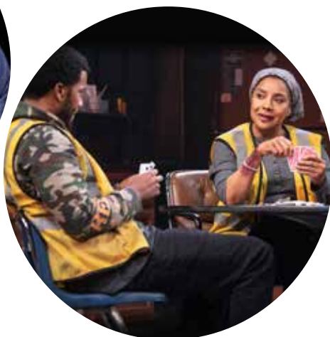
TOP: Ruben Santiago-Hudson in LACKAWANNA BLUES LEFT: Mary-Louise Parker and David Morse in HOW I LEARNED TO DRIVE RIGHT: Joshua Boone and Phylicia Rashad in SKELETON CREW